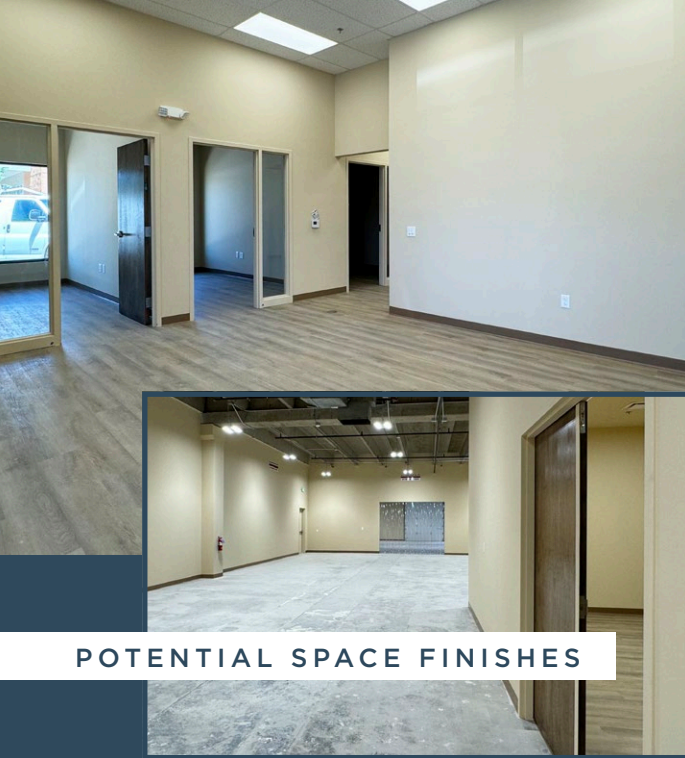
POTENTIAL SPACE FINISHES